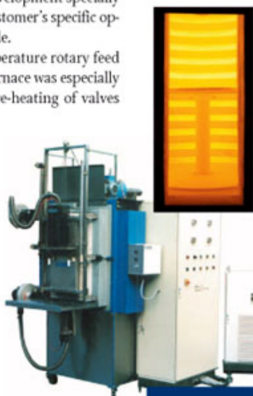
Rotary feed table-chamber furnace for pre-heating of forging parts

Concluding should be said that only a combination of modern calculation methods with the use of advanced materials and technologies, paired with optimal control technologies, will lead to a customized solution for the continuously increasing demands of each individual customer. ■