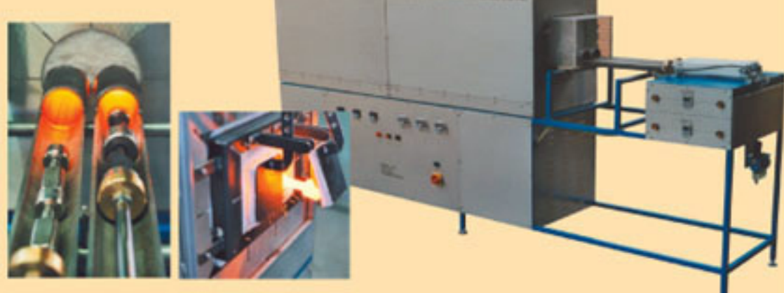
Tubular furnace for pre-heating of valve forged parts